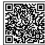
QR code 2