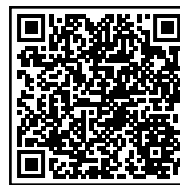
QR code 1

Rodney E. Soher Curator of Western Asiatic Antiquities